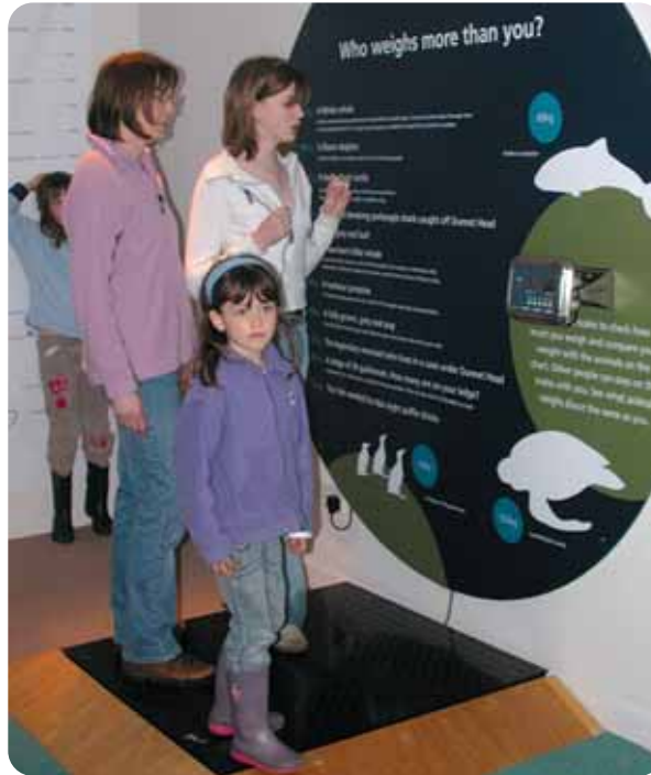
Seadrift Visitor Centre, Dunnet by The Highland Council