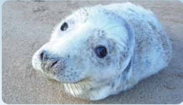
Grey Seal pup

You may be lucky to see where the grey seals come ashore and use the beaches to pup