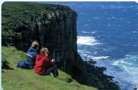
Cliff scenery at Dunnet Head

You can enjoy the scenery as well as watch for wildlife