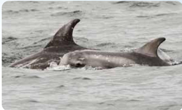
Risso's dolphins

Dolphins often come into sheltered bays like Dunnet to feed and play